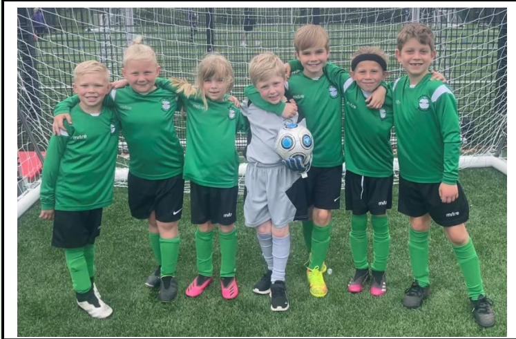
Year 1 and 2 Team