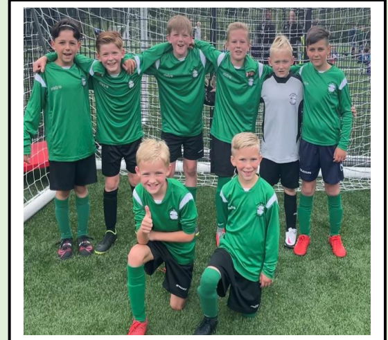
Year 3 and 4 Team