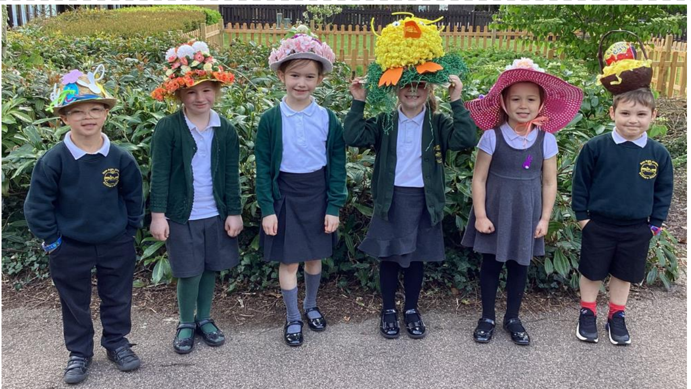
Some of the Children from the Roundwood Spring Hat Parade at the Start of the Term